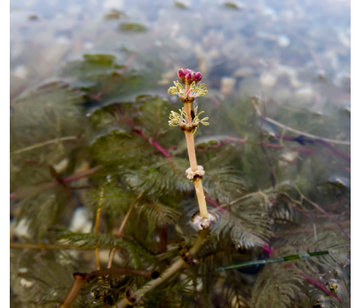
Eurasian Water Milfoil

2,4-D Diquat Dithiopyr Glyphosate Oryzalin Pendimethalin Prodiamine